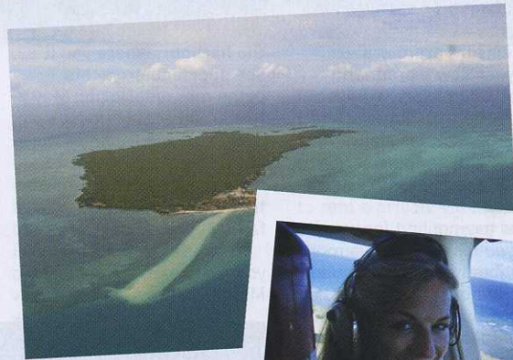
A bird's-eye view of the Quirimbas, a group of 32 coral islands near Mozambique

It was only when we sought advice from Rainbow Tours, who specialise in tailor-made holidays to Africa and the Indian Ocean, that we found out about the Quirimbas Archipelago, a group of 32 coral islands off the north coast of Mozambique. Until very recently, the area was virtually unknown as a holiday destination due to 20 years of civil war. But