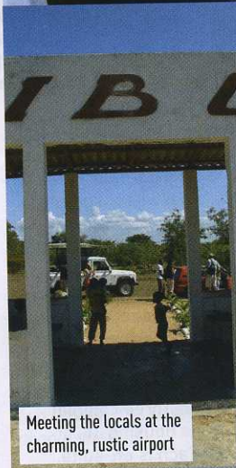
Meeting the locals at the charming, rustic airport