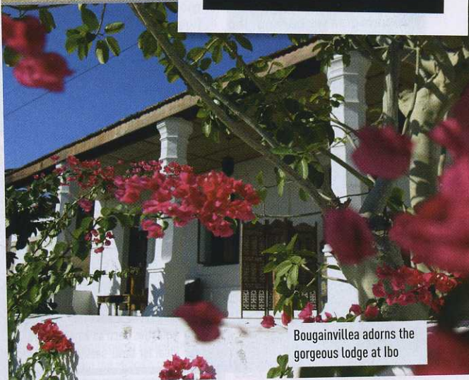
Bougainvillea adorns the gorgeous lodge at Ibo